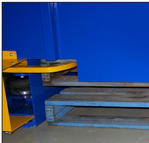
> Pallet ready for pallet truck